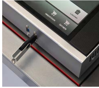
■ flexible interfaces