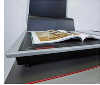
■ easy installation thanks to plug'n'scan