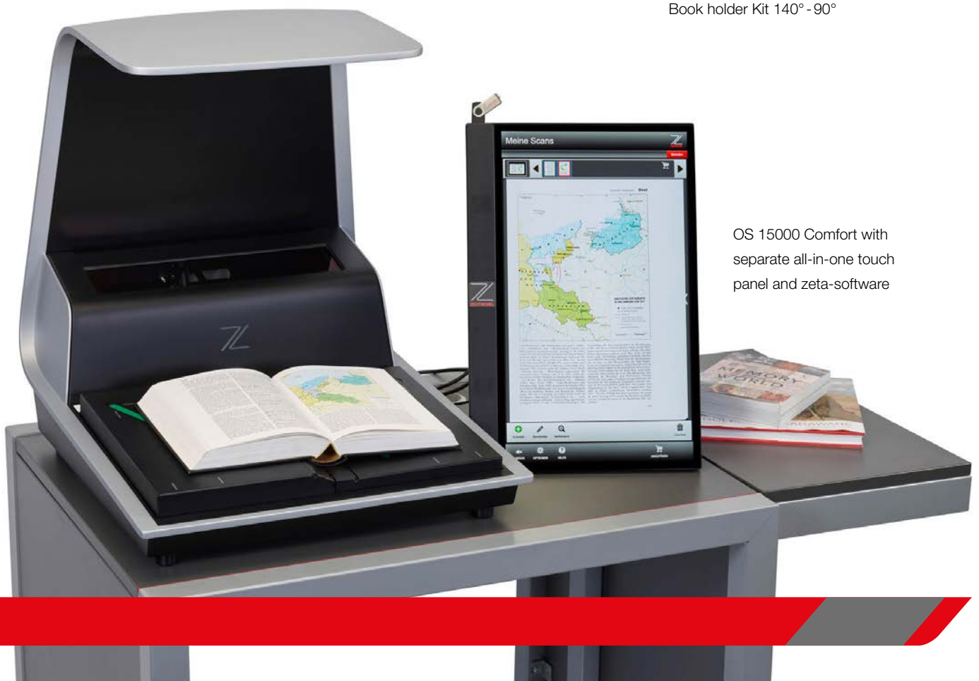
OS 15000 Comfort with separate all-in-one touch panel and zeta-software