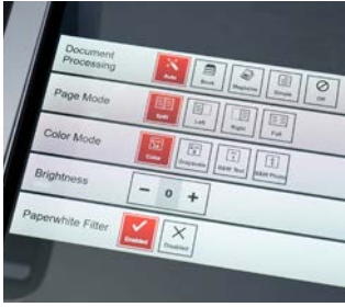
■ touch panel (21,5") with multi-touch technology