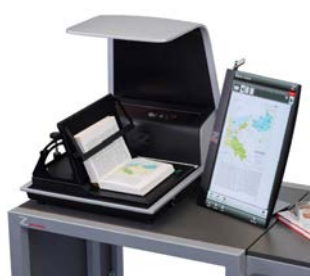
■ Version OS 15000 Comfort with touch panel and zeta software