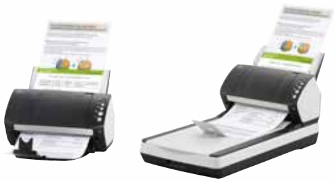
fi-7140 / fi-7240 – A4 Portrait at 300 dpi 40 ppm / 80 ipm Scan mixed batches up to 80 sheets